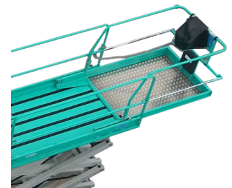
Manual deck extension of 39" 510 lb Capacity Number of Occupants - 2