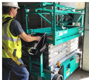
Narrow platforms and foldable guardrails allow for easy access through standard doorways